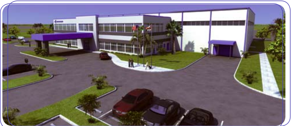
Illustrative drawing of Embraer's new service center facility at Ft. Lauderdale/Hollywood International Airport in Ft. Lauderdale

The new 56,000 square foot facility will be capable of providing comprehensive aircraft care, including routine inspections, unscheduled maintenance, structural repairs, systems checks and troubleshooting, 24/7 assistance from Aircraft On Ground (AOG) rescue teams, compliance with ADs and Service Bulletins and a comprehensive materials logistics support program including inventories of expendable and repairable parts.