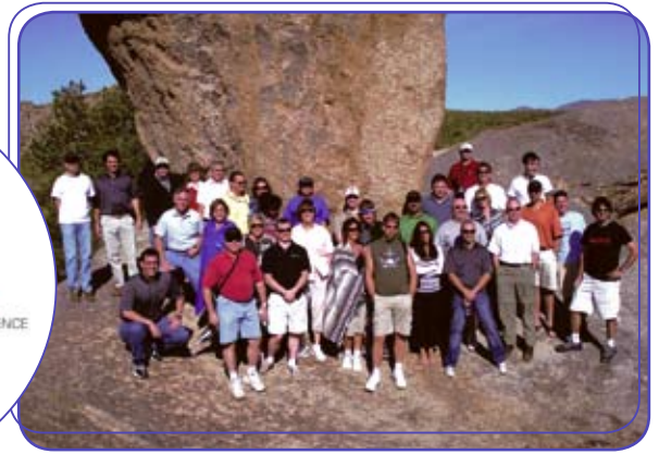
Customers tour of the Sonoran desert