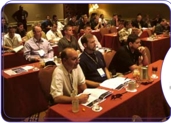
Customers' participation at EEOC 2007